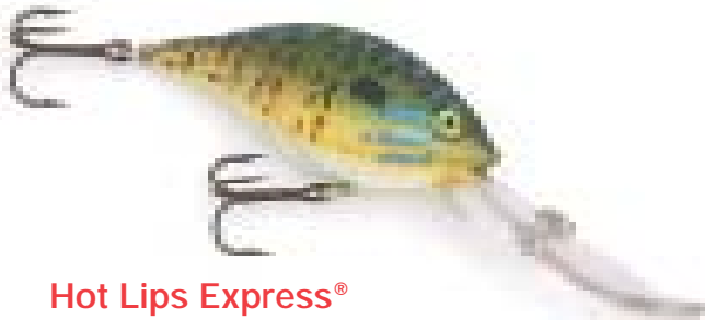
Hot Lips Express®