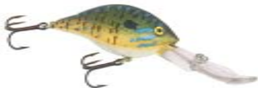
Hot Lips Express®